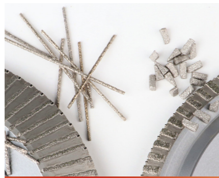
Diamond segment manufacturing for our tools