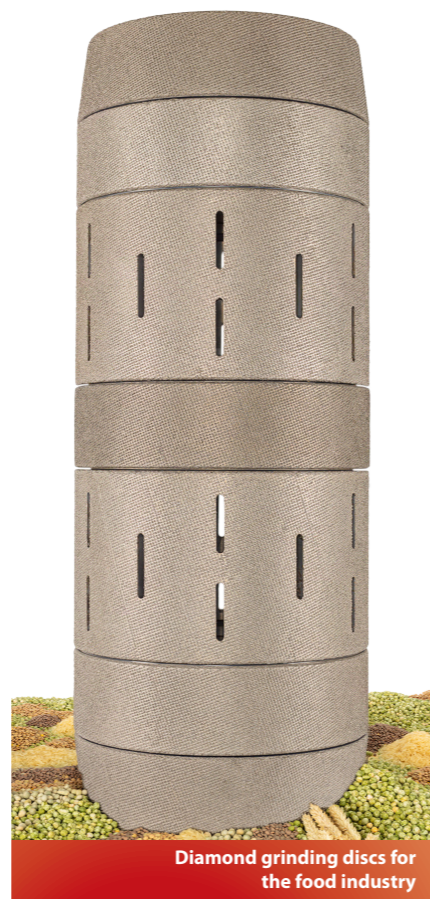
Diamond grinding discs for the food industry