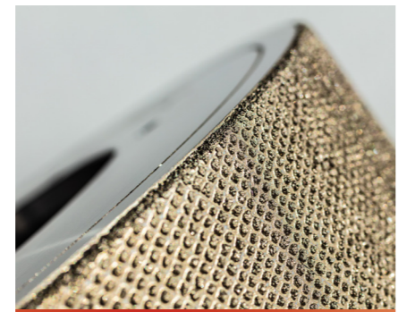
Multi-layered diamond coating arranged in groups