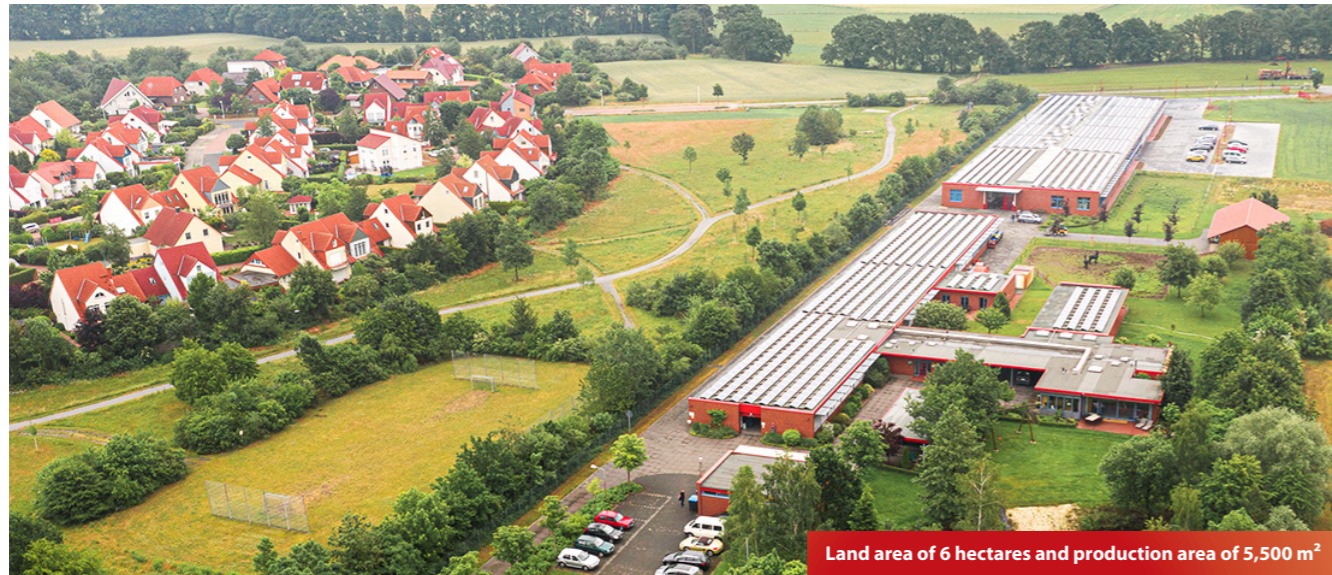
Land area of 6 hectares and production area of 5,500 m 2

As a developer and manufacturer of high-precision diamond dressing tools, we, ROT GmbH, offer innovative and customized solutions for our customers.